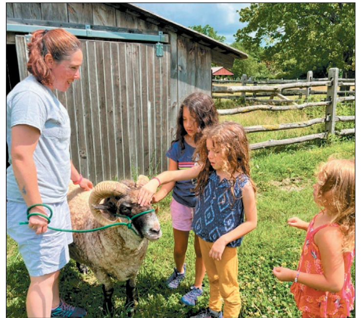
The Buffalo Niagara Heritage Village will hold its Agriculture Fair in August.

Admission to the Agriculture Fair costs $20 for adults, with discounts available for seniors, students, and the military. Members of the